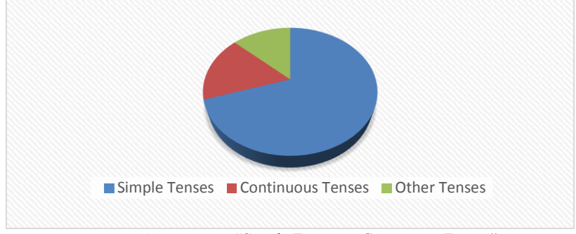
Fig. 1 – Diagram "Simple Tenses vs Continuous Tenses"

The percentage of the tense forms usage is as follows: Present Continuous -16%, Past Continuous -2%, Future Continuous -0.5%.